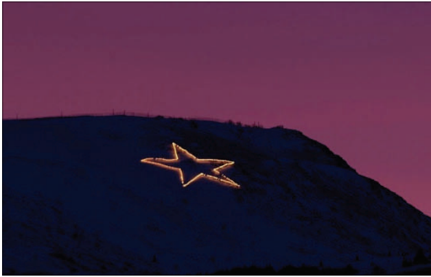
An Anchorage icon, the Christmas Star below the Site Summit launch area has been there since Site Summit soldiers built it in 1960.

The Missile Launch and Storage Area sits at the 3,000 foot elevation, approximately 5,000 feet from the Battery Control Area. It comprised the missile launch and storage bunkers, the warhead magazine, and the launch control building.