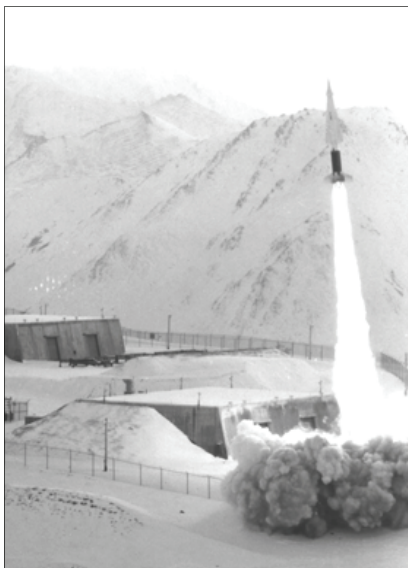
Live fire at Site Summit ca. 1961.

tions near Anchorage and Fairbanks, the U.S. Army decided in 1955 to install the Nike Hercules missile system. The missiles, armed with high explosive or nu-